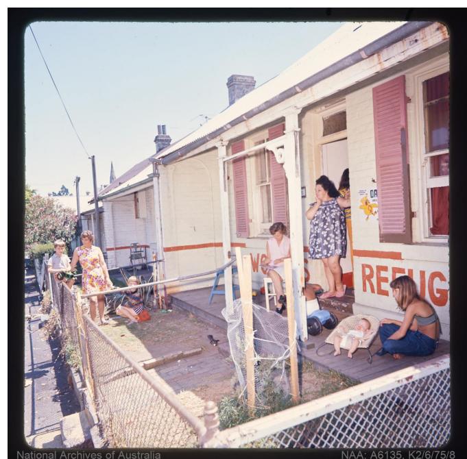
National Archives of Australia NAA: A6135, K2/6/75/8