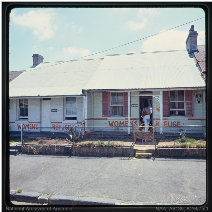
National Archives of Australia NAA: A6135, K2/6/75/1

governments that domestic violence was a real issue.